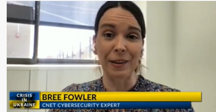
WFRV: RUSSIA CYBERSECURITY THREAT