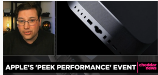
CHEDDAR NEWS: APPLE EVENT

Tech Generalist, Apple, Microsoft, Gaming