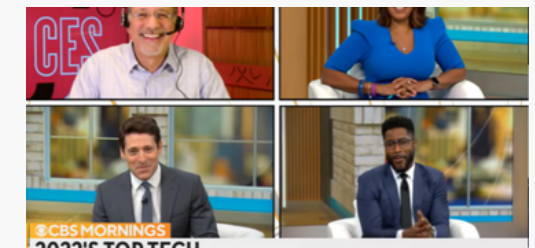
CBS MORNINGS: TECH IN 2022

Tech Generalist, EV's, Telehealth, Health Tech, Mobile, AR/VR Metaverse, Smart Home