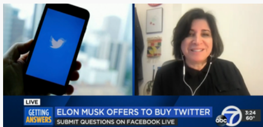
ABC 7: ELON MUSK & TWITTER

Tech Generalist, Silicon Valley, Diversity in Tech, Tech Giants