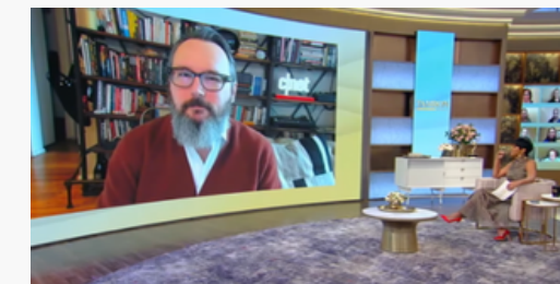
TAMRON HALL: AIR TAG SAFETY