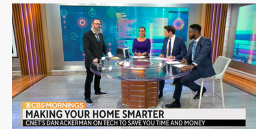
CBS MORNINGS: SMART HOME TECH

Tech Generalist, Devices, Computers, Gaming