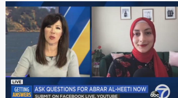
ABC 7 NEWS: ELON MUSK & TWITTER