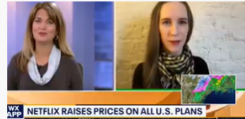
KRIV TV: NETFLIX INCREASING PRICES

Digital Media, Streaming Services, Entertainment