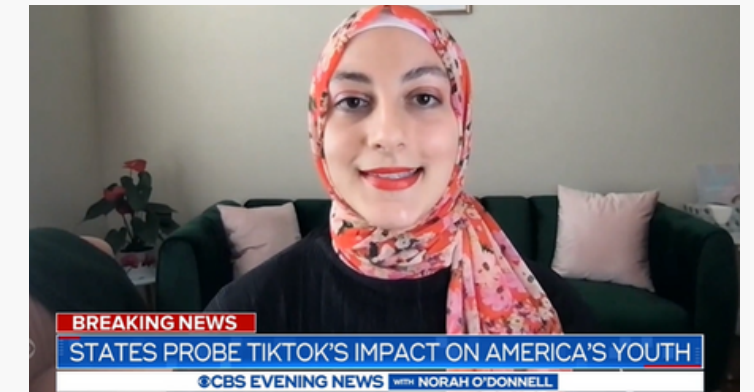
CBS EVENING NEWS: TIKTOK HARMING CHILDREN