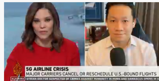
AL JAZEERA: 5G & AIRLINES

Tech Generalist, 5G, wireless, streaming devices