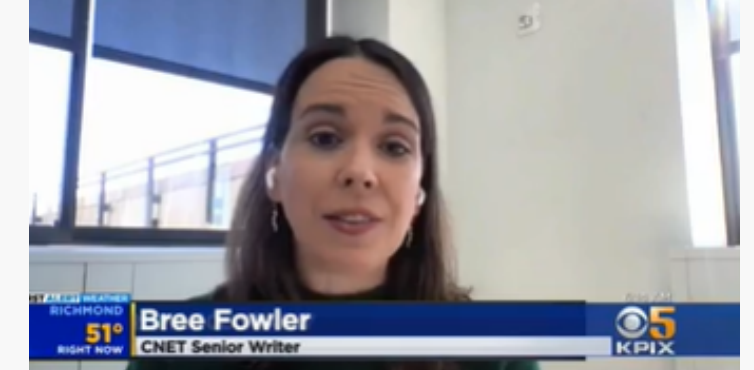
KPIX: VALENTINE'S DAY SCAMS