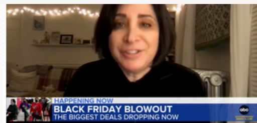
GMA: BLACK FRIDAY SHOPPING TIPS