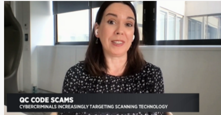
CBSN: CYBERCRIMINALS AND QR CODES