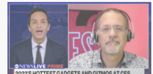
ABC NEWS LIVE: CES 2022