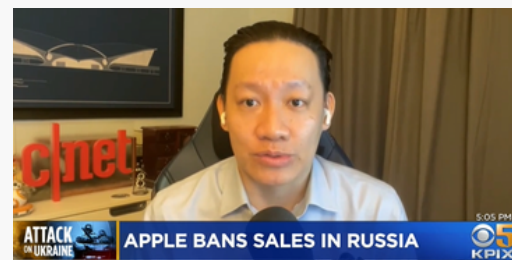
KPIX: BIG TECH SANCTIONS AGAINST RUSSIA