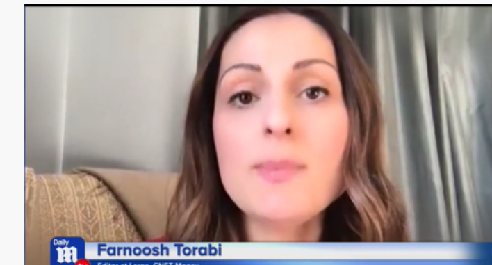
DAILY MAIL: 2022 FINANCIAL GOALS