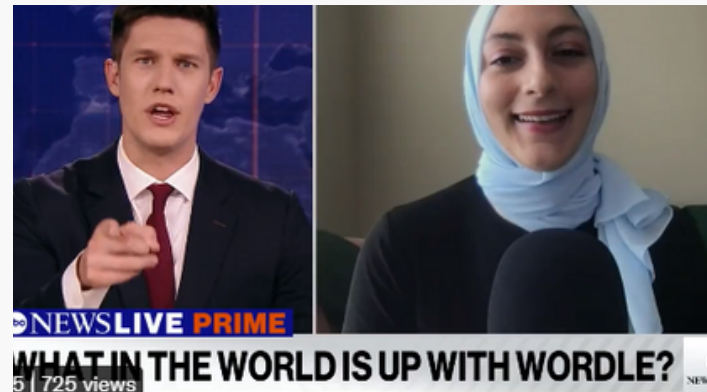
ABC NEWS LIVE : WHAT'S UP WITH WORDLE

Social media trends, entertainment, pop culture and digital accessibility