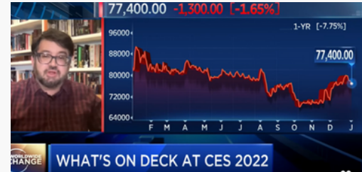
CNBC TV: CHIPS, EVS AND THE METAVERSE

AR/VR, Tablets, Gaming, Future/Emerging Trends